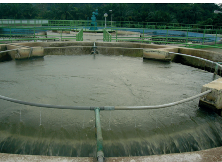
INDONESIA (2004) Municipal Water plant Water disinfection with gas chlorine