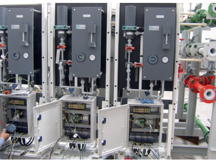
ABU DHABI, UAE (2007) Onshore gas development project Disinfection of fire water, service water and drinking water

MORE THAN 1500 CLIENTS IN MORE THAN 40 COUNTRIES