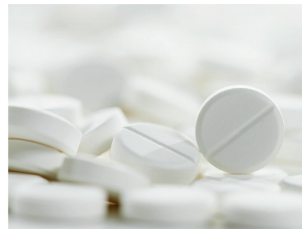
SLOVENIA (2011) Pharmaceutical company Disinfection of process water