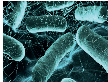
SLOVENIA (2009) Hospital Izola Dosing & measurement of chlorine dioxide for legionella prevention

For more references see www.controlmatik-abw.si