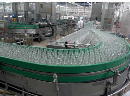
NETHERLANDS (2013) Food industry Dosing station for process water disinfection in production line

→ With our experience, knowledge and a large number of references, we enjoy a good reputation in the world of Water treatment Industry and confidence of our clients.