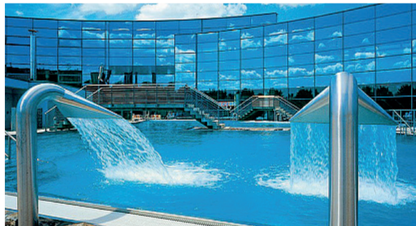
SLOVENIA (2010) Water park Atlantis Water treatment for a complete facility ( 2000m 2 water surface)